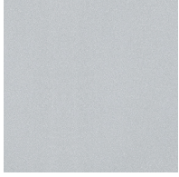
Sparkling Silver - 01