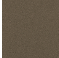
Ancient Bronze - 28